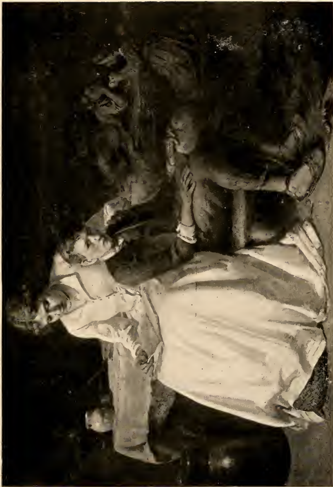
THE BOYHOOD OF LINCOLN "What they did I too may do"